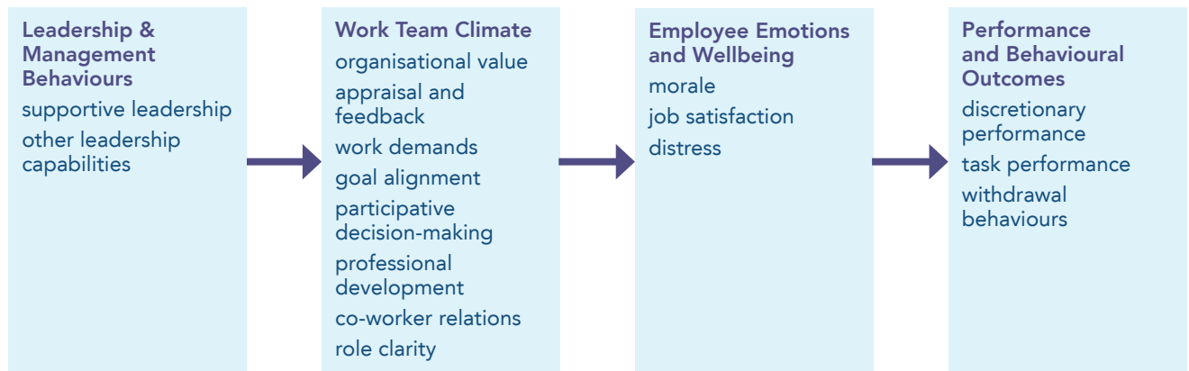
Figure 1: Organisational health model

2004 Dr Peter Cotton Comcare Prevention Project